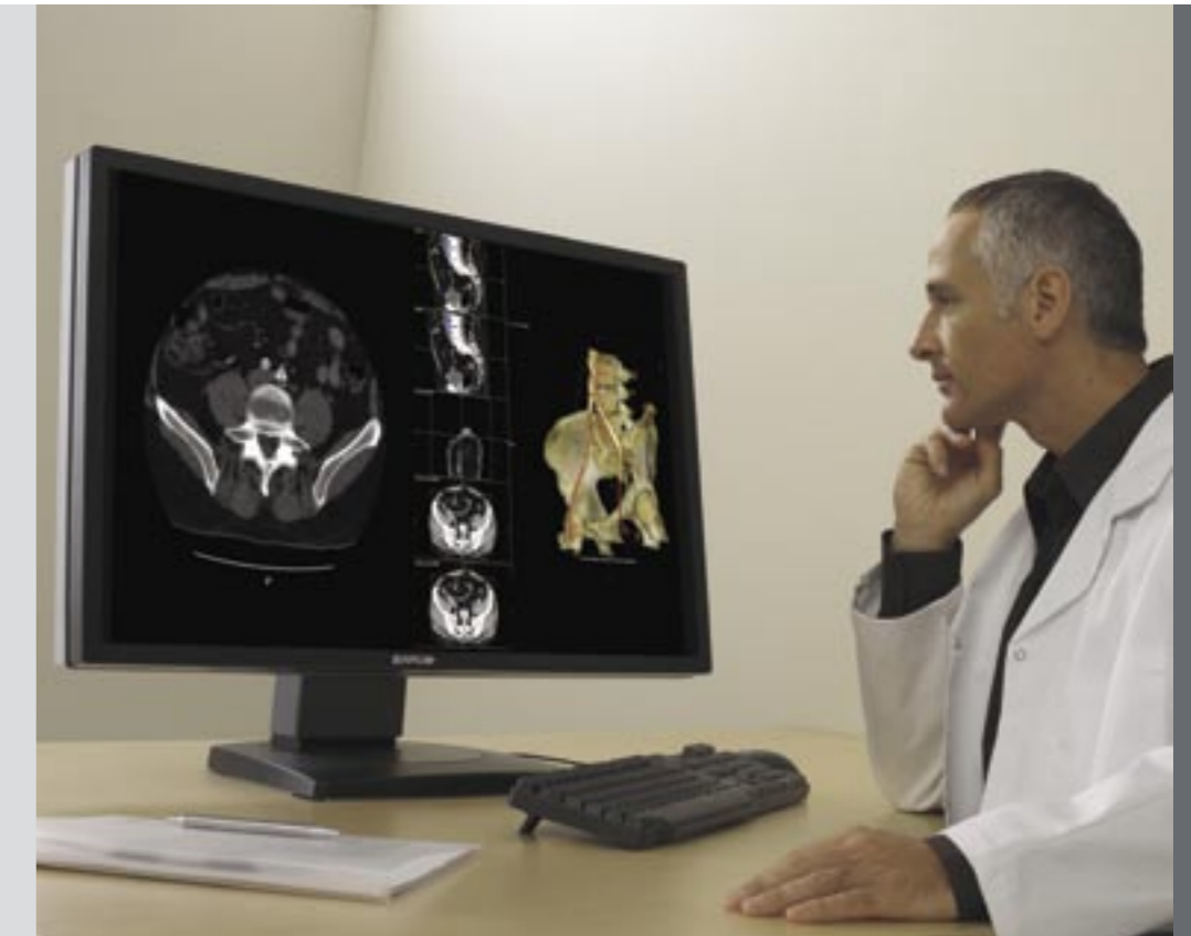
Large-screen medical color display system